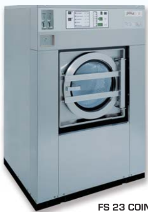
FS 23 COIN