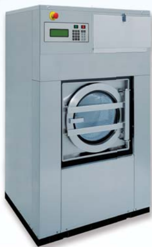
FS 23 PRO